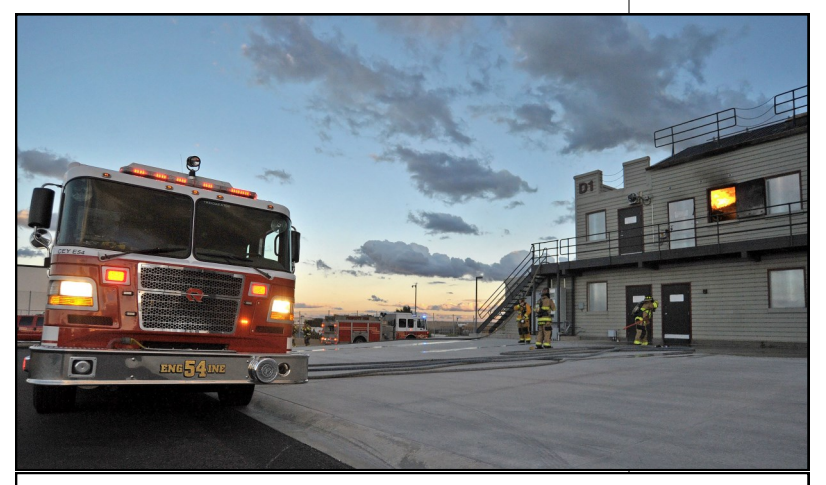
Taken during live fire quarterly training