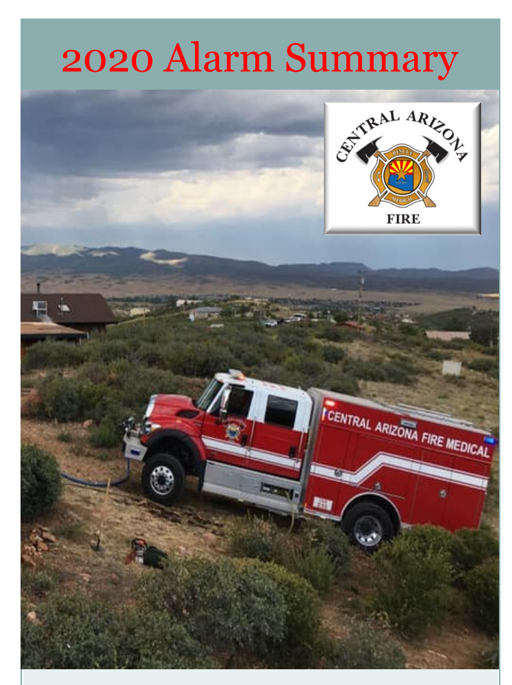
Central Arizona Fire Medical Authority "May we never lose our way."

Excellence – We will demonstrate a high level of knowledge and skill in all aspects of our profession.