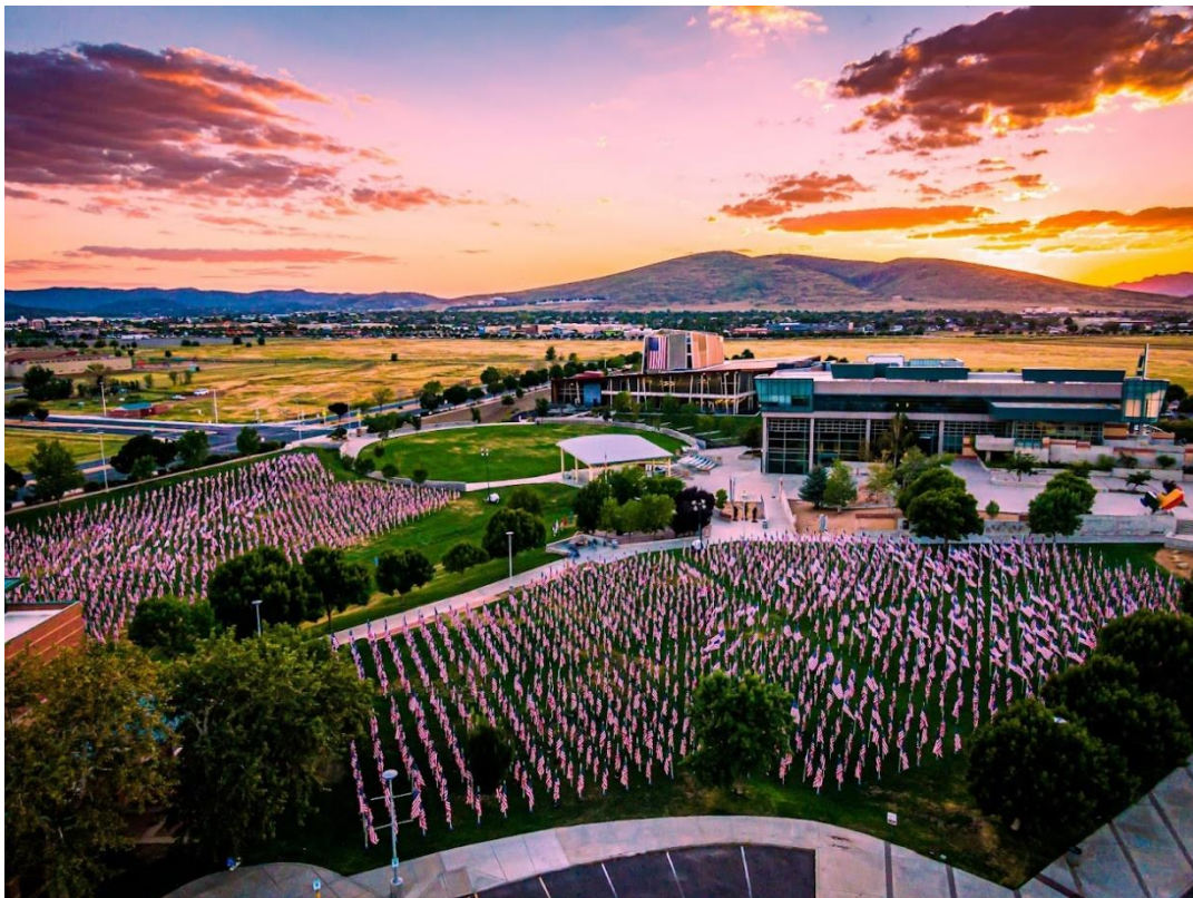
Healing Field 2021